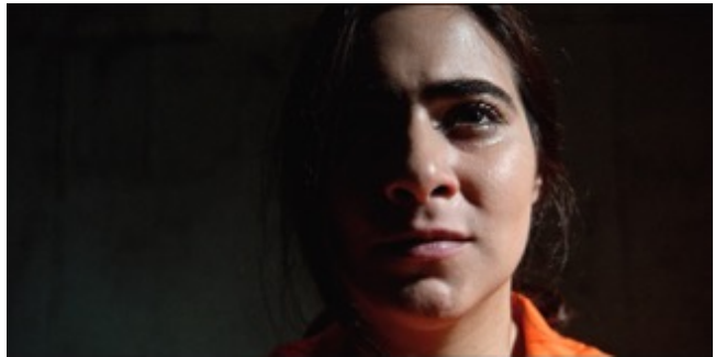
Skin tones are closely related to the MTF curves of the zooms, the sharpness they can show in the finest details, and the micro contrast they handle.

The light uniformity is frankly good and the differences are irrelevant in daily shooting, although they can be seen on the cards, as is the vignetting that is not noticeable either. Chromatic aberrations are sufficiently corrected and are generally insignificant and only in some focal length are they observable if one looks closely at some area of the image. So, I can tell you that they are excellent lenses in all the parameters that we have measured and observed. But I want to highlight two aspects that have been fundamental for the choice of the Premista, which are their excellent behavior with the veil, the flare and the color.