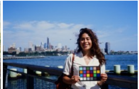
Skin tones and color chart with different color temperatures and contrast. Ektachrome 100 scan.