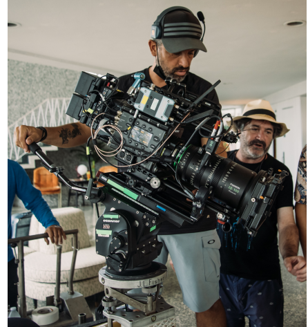
Premista zoom 28-100mm T 2.9 with Sony Venice

If you agree, I'll give you a specific example of how I think zoom affects the narrative of the series. We made a shot where Ledher walks down the corridor of the jail, when they lock him up for good. He is accompanied by two guards, who with him arrive at the cell, open the cell door and Ledher enters, the guards close the door and it has a small opening at the height of the face with bars where Ledher leans looking out the hall. The final frame of the shot is Ledher's face behind the bars seen from the corridor. In this plane we close the zoom towards his face from a more general frame size where the guards can be seen.