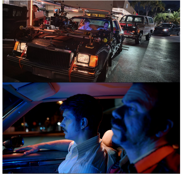
Car Grip. Premista 28-100m y 19-45mm with the final lateral shot

When I zoom in on the actor's face, I am changing the angle of view and depth of field. When I change the angle of view I am changing not only the field of view that the lens can cover but also the relative appearance of the distance between the various terms. Thus, when closing the zoom on the actor's face, the space seems to fall on top of the character, bringing the different terms closer, as if the space were swelling around him, as Pasolini points out "the zoom, with its long focal that stick to things stretching them out like overblown loaves" 1 . That is to say, the prison "swallows him up". The space/image (I use this term recalling the idea of Vincent Pinel that "in the zoom the movement is not made in relation to its subject but in relation to the image") 2 thus acquires a double meaning, on the one hand of extension of the emotion of the character, but also, of the meaning that all of us as spectators give to prison: a closed place, as if the space were closing in on one, so it participates in a double condition that unites the sensation of the character, of loss of freedom, loneliness, oblivion and the sensation of the prison space that closes, engulfs the character, thus reaffirming in the viewer's mind their own feeling about what prison means and that it is the result of all its symbology in our culture: from cinema, painting, music videos or literature.