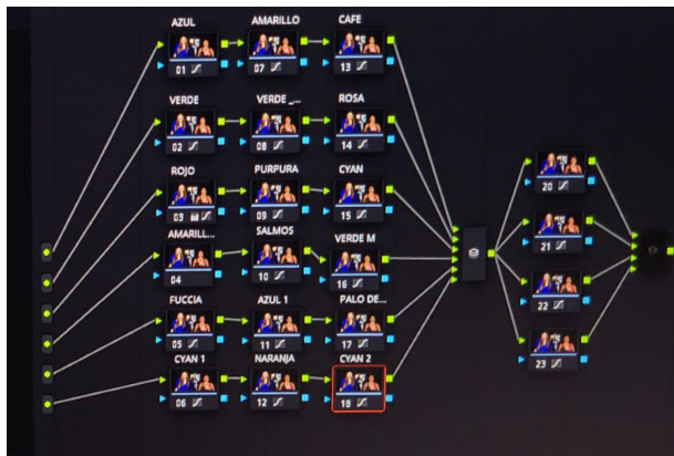
Davinci Resolve basic tree