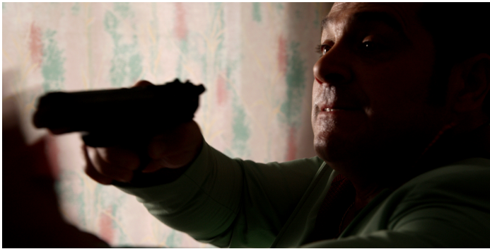
The focus is on the illuminated part of the face, note the blur of the gun in the foreground as well as the illuminated curtain in the background

AB: Another aspect is how the lens flares are, taking into account that in current productions the flare is one more tool to create dramatic sensations in the viewer.