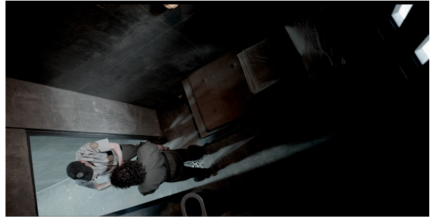
Ledher jail. Overhead shot. Premista 19-45. Focal 19mm T 2.9

AP: Regarding geometric aberrations, both pincushion and barrel distortion are irrelevant in the 28-100mm and 80-250mm zooms, however, with the 19-45mm barrel distortion is more noticeable, especially in the longer focal lengths. short, although within normal margins. I have shot scenes inside the car with the 19mm and the distortion does not cause any problem, although it is true that in some circumstances, for example, when filming the interiors of small planes, I have used Sigma cine FF lenses together with the Rialto given the narrowness of the same.