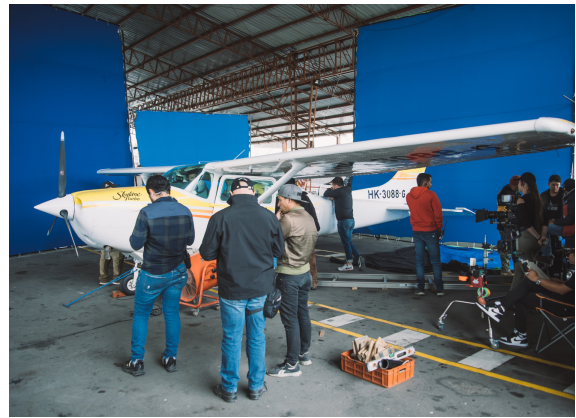
Blue Chroma Key. Plane Ext/day

AP: In fact, we have done many chromas in the studio, but also in light aircraft, commercial planes and cars, among others, as well as digital effects to highlight fires, smoke or gunshots, and also 3D models interacting with real spaces. For all these effects, there is something that is decisive for their good execution, which is the resolution of the lenses and the resulting acutance of the image. For the resolution, the quality of the lenses is essential, since they have to resolve the finest details with the highest possible contrast and this is important, for example, when making Chroma Keys.