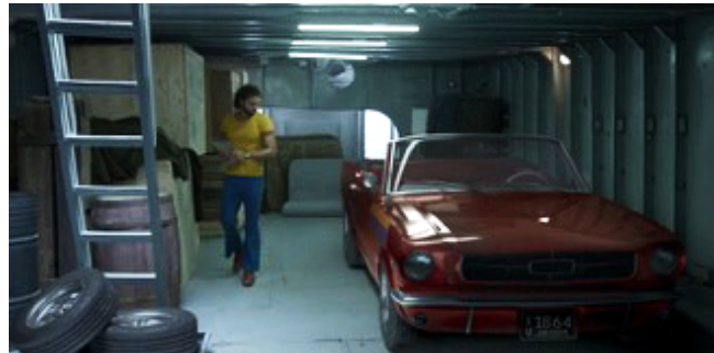
Final composition without color correction

Shot with Premista 28-100mm zoom. Car modeled in 3D and integration by Laburo digital.