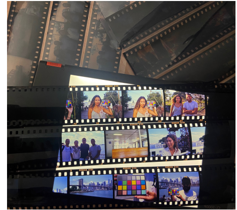
Ektachrome 100 reversible material

AP: As I was saying, those characteristics of the Premista that have to do with contrast, veil and color are decisive for the creation of the image of the series. Just as I wanted to use the zoom in the way it was done in the movies of the 70s and 80s, it seemed consistent to use the Ektachrome reference for the color and contrast of the series. That is, referring to the current Ektachrome 100 for which time has not passed. I wanted to escape from the vintage tone that the old Ektachrome could have. To achieve that colorimetry and considering our limitations, it occurred to me to photograph a color chart and skin tones with Ektachrome 100 in different light conditions, direct sun, shade, sunset and indoors with artificial light. We did all of this in NY and there we revealed it and digitally scanned it in 4K resolution and in 709 color space.