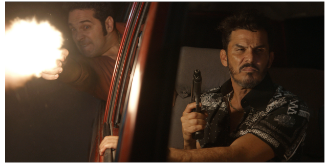
Persecution. Zoom Premista 19-45mm with Rialto on car-grip

AP: In fact, the maximum aperture value of the zooms is 2.9 with the exception of the 80-250mm, which when it is at very long focal lengths is 3.5 and the truth is, working on those scenes that you mention at 2,500 ISO I have not had any major problems, in fact, I have worked most of the night scenes at almost T 4, to give you an example, in the night cars I have used a lot of Nanlite Litolite 5C and I put them at 1% or 2% intensity working with T 2.9, the same with the Astera tubes that worked them at 50% of their maximum intensity.